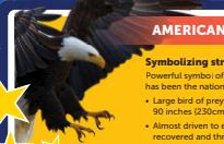
AMERICAN EAGLE Haliaeetus leucocephalus